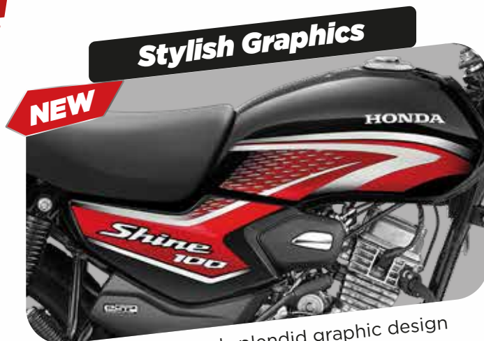
All new enriched and splendid graphic design that compliments the overall look of the bike.